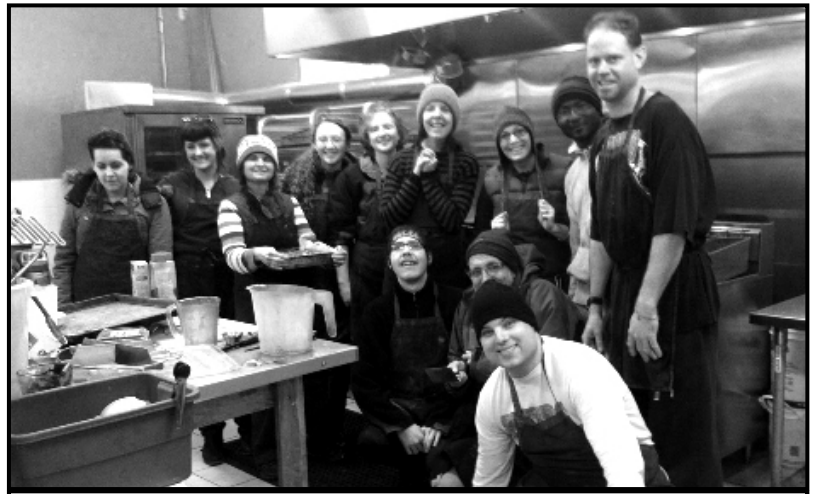
Last winter, a broken heater early in the morning, inspired Maurita's Kitchen workers and volunteers to bundle up as they prepared food for the Queen Street Commons Café.

Through conversations about Buber, Roseto, Geel and Mystagogy in the Local Democracy class this past winter my own understanding and practice has been enlivened. This new year we are running the Diploma in Local Democracy again and I look forward to the new explorations that will occur. There's no predicting what learning will arise but I fully trust that new participants will add their own voice to the wisdom of our group. Will you join us in this collective journey?